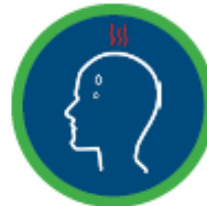
Not feeling well