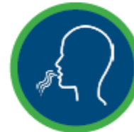
Nausea, vomiting, diarrhea