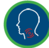
Sore throat, trouble swallowing